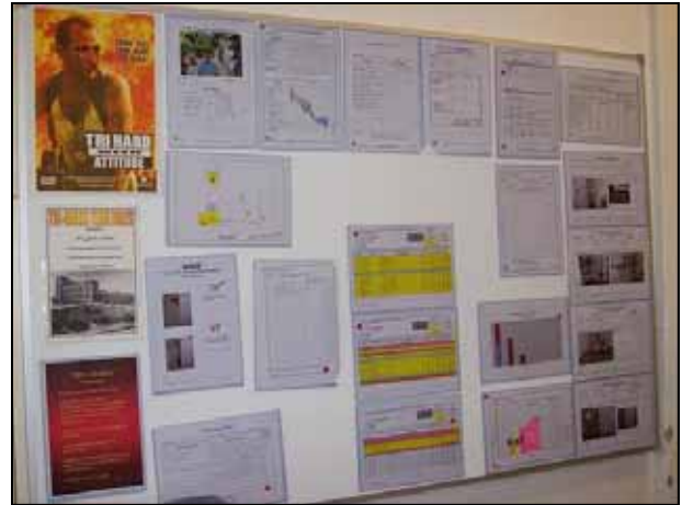
Afternoon Shift Noticeboard / Scoreboard, “Try Hard With Attitude”

However, part of the TPM 3 journey is also about having some fun along the way and a couple of the teams at Sanitarium Cooranbong have really taken this to heart with some outstanding “extra” creativity on their Noticeboards and Scoreboards. Who knows, you may even discover some hidden talent that your team members.