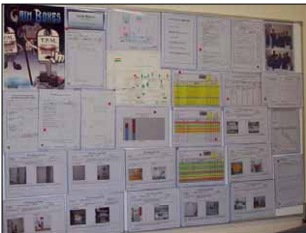
Day Shift WAM Noticeboard / Scoreboard, “Grim Boxes”

The creative talent that these Work Area Management teams uncovered when they wanted to create a Team banner for their noticeboards / scoreboards belonged to their fellow workmates.