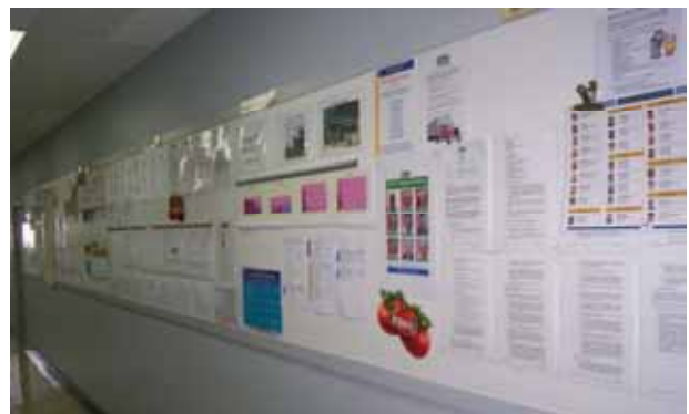
Site Scoreboard and Noticeboards

Again tangible results of their activity will be discussed by Alastair McCreddon, Plant Manger Echuca, at the forum, including a presentation on how the 5 Level TPM 3 Milestone Excellence Award changed their improvement activity from one of "Cherry Picking" to a structured approach focusing on what was important to support the business goals and objectives.