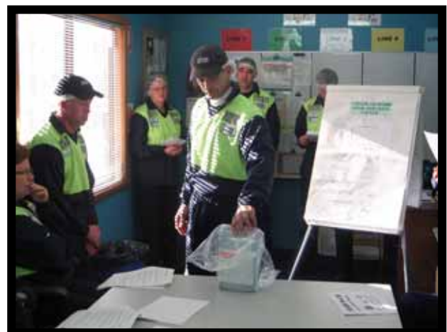
OEM-3 Final presentation and cost reduction activity