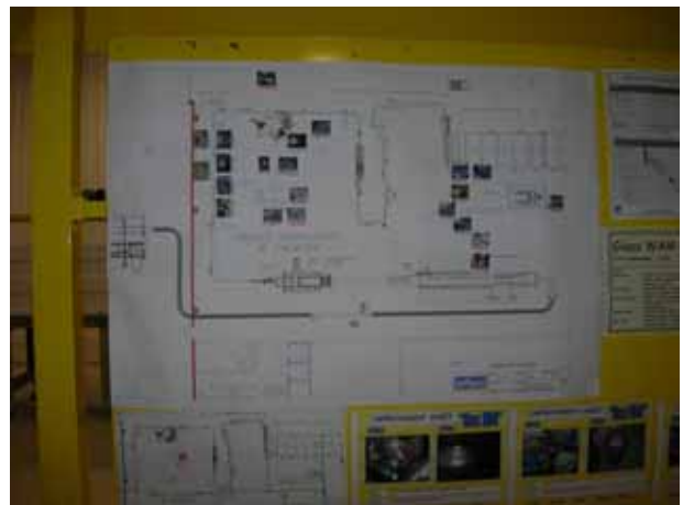
OEM-1: Map of plant to highlight location and status of defects