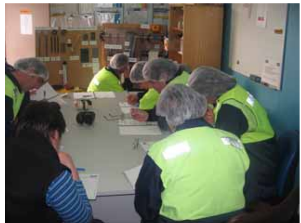
OEM-4 Classroom training, conveyors and drives