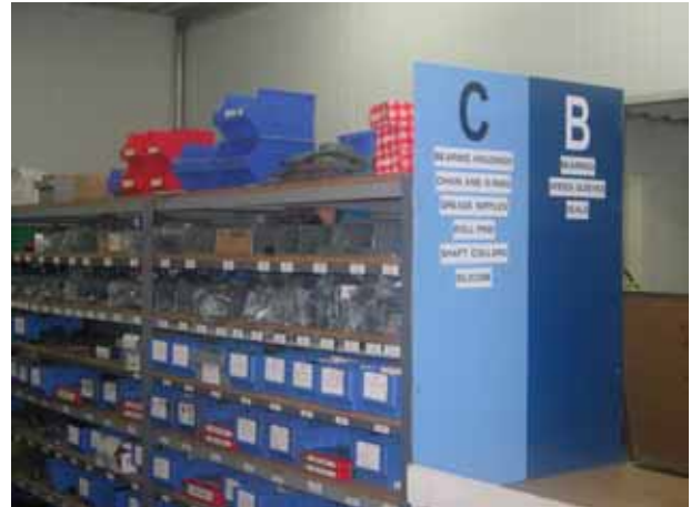
Maintenance Store MAM activity

Devonport will be giving a special presentation at this year's forum detailing their OEM-4 activity, discussing the benefits of Maintainers training Operators in the function of their equipment.