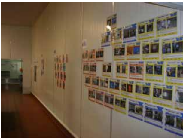
Hall of Fame: Improvements posted in the plant

We will be hearing from the Lab team at the forum, as they are finalists in this year's TPM 3 Aussie Cup Team Competition.